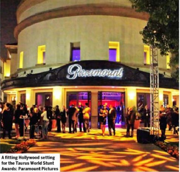
A fitting Hollywood setting for the Taurus World Stunt Awards: Paramount Pictures

WORDS: PAUL WILSON.