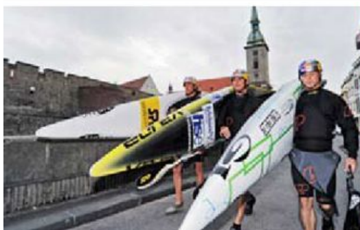
Bratislava The cancellation of the kayak championships kept pavement space at a premium Mat Rendet